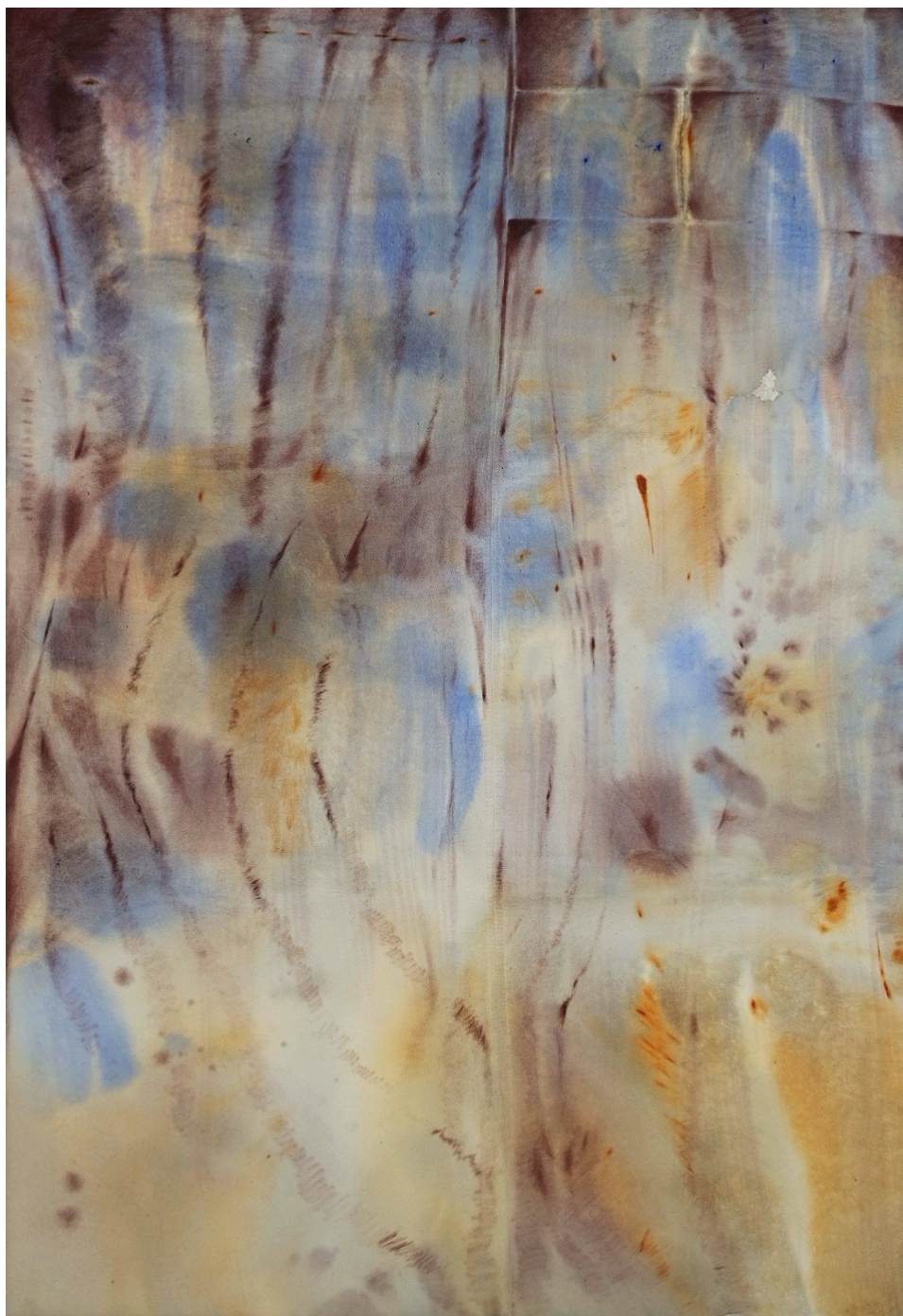
Conversation with a Rock, 2025 ink and acrylic paint on sewn canvas 162 x 112 cm