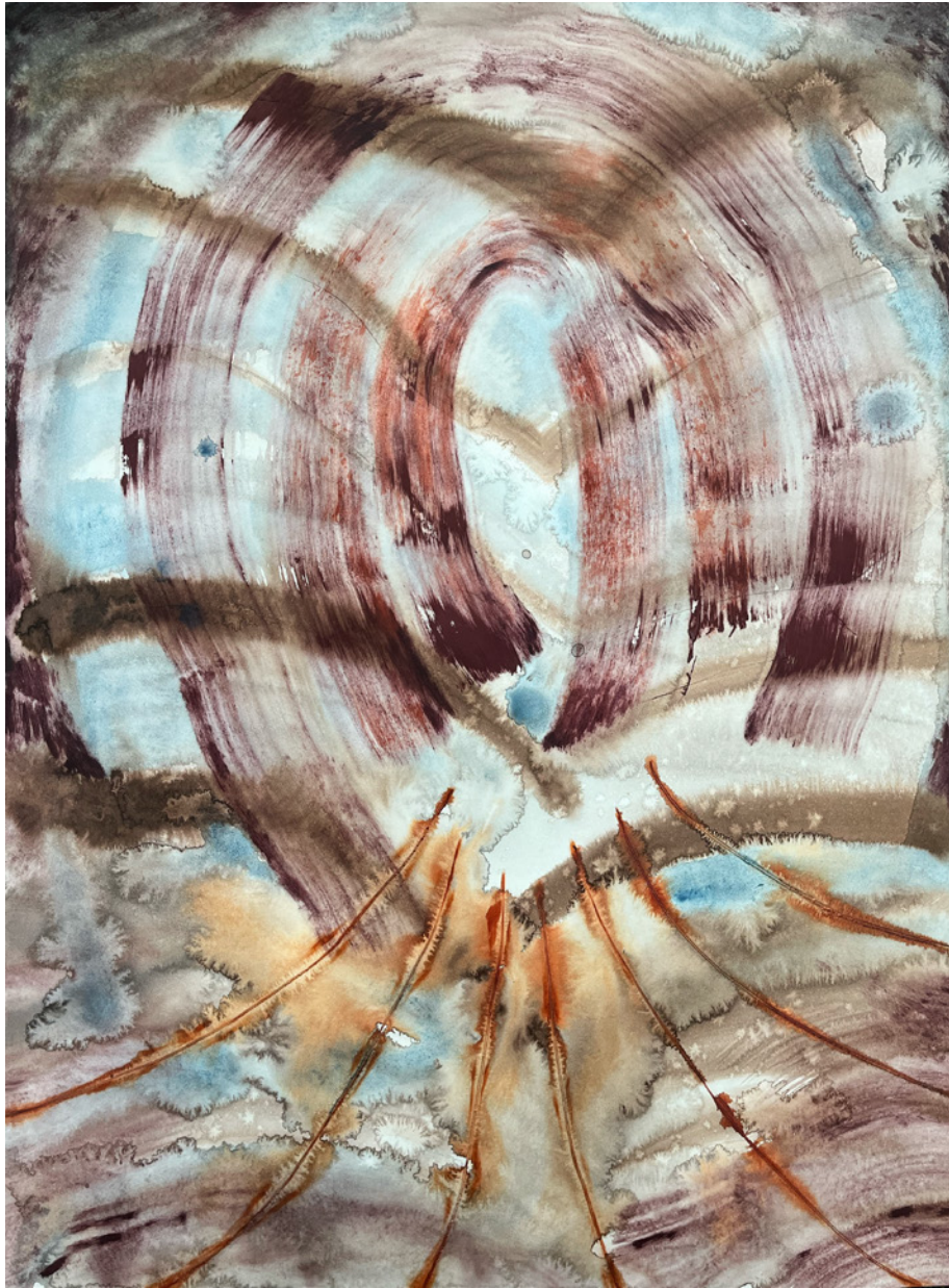
Doorway #2, 2025 ink on paper 80 x 60 cm (unframed)