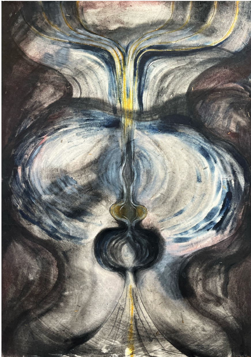
Doorway #1, 2025 ink on paper 80 x 60 cm (unframed)