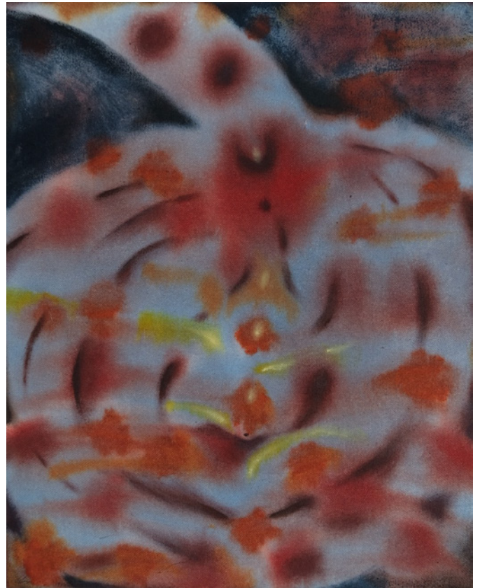
(right) Sprouting Egg, 2025 ink and acrylic paint on sewn canvas 41 x 33 cm