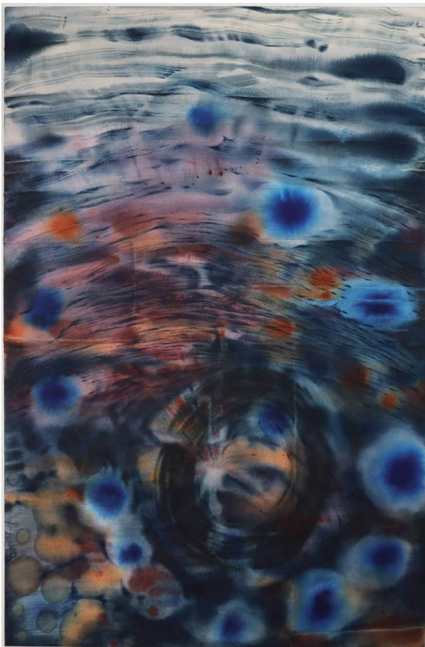
Into the Void, 2025 ink and acrylic paint on sewn canvas 180 x 118 cm