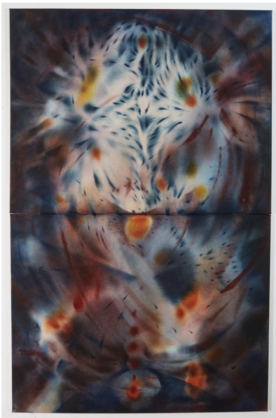
In Symbiosis , 2025 ink and acrylic paint on sewn canvas 92 x 142 cm overall (2 panels)