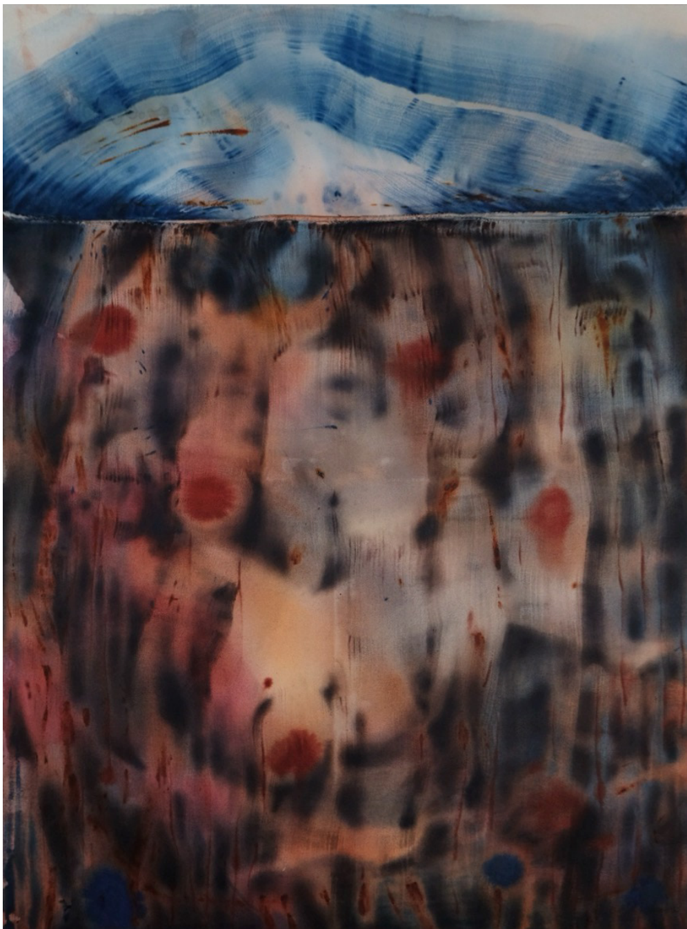
Submerged , 2025 ink and acrylic paint on sewn canvas 200 x 150 cm