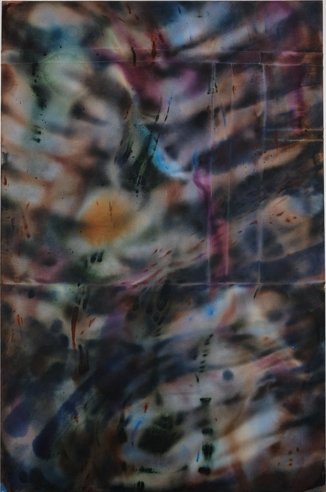
Seeking Stillness, 2025 ink and acrylic paint on canvas 180 x 118 cm