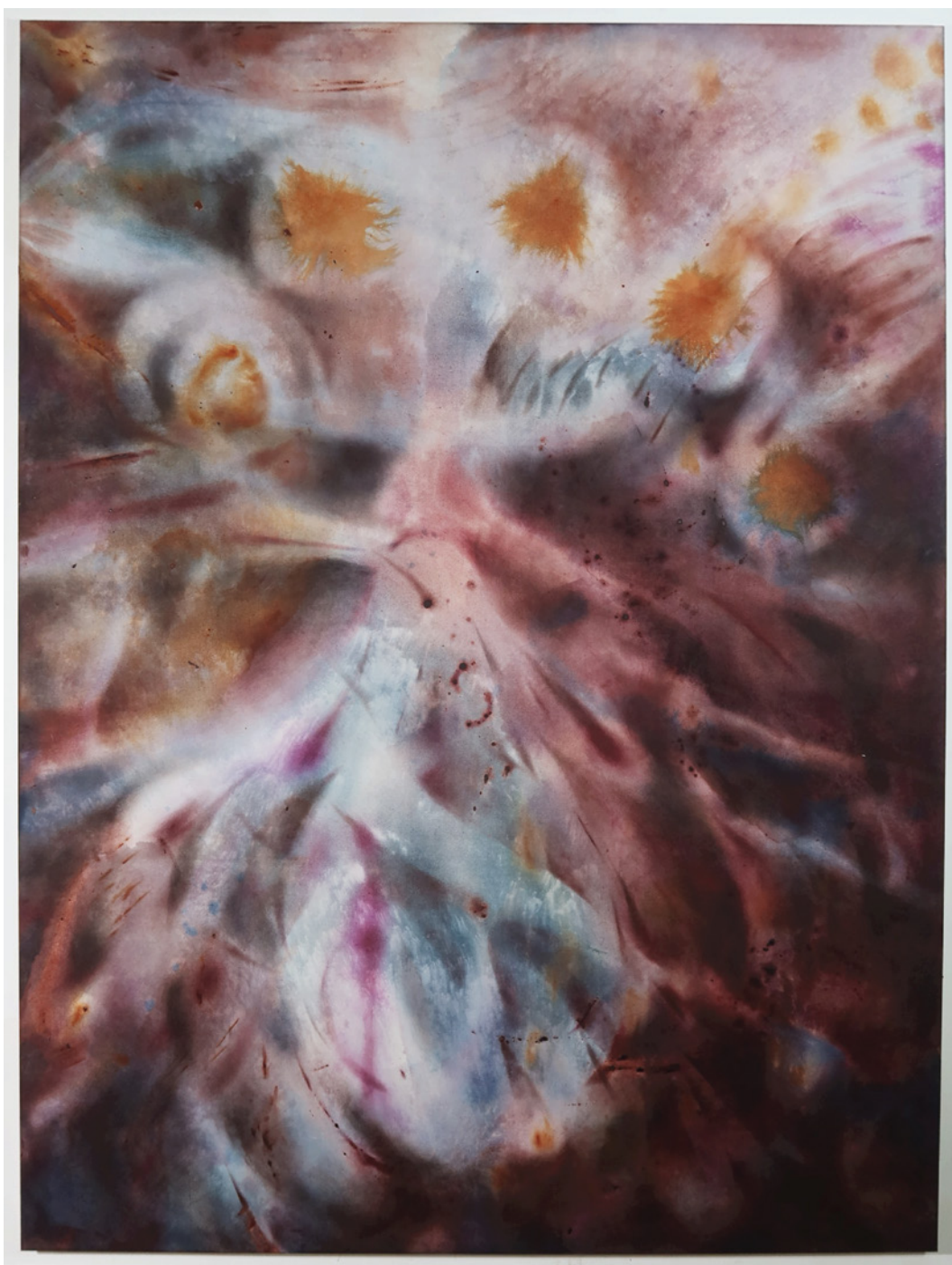
Guardian Angel , 2025 ink and acrylic paint on sewn canvas 200 x 150 cm