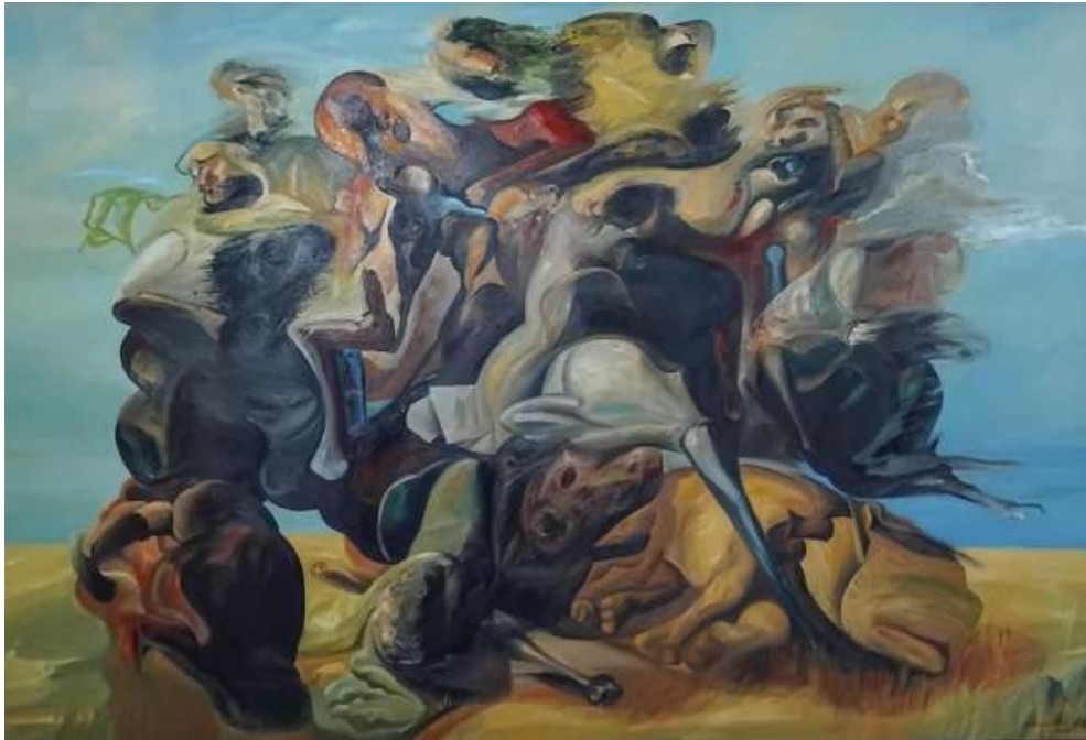
NGAKAN ARDANA , A Studies for Figures at the Base of The Lion Hunt #1 200 x 300 cm, Oil on Canvas, 2024