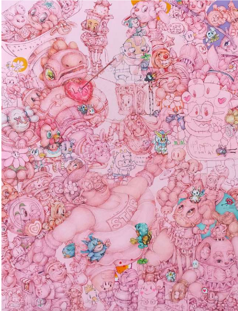
DHANOË , Afirmasi Kebahagiaan 140 x 160 cm, Acrylic on Canvas, 2024