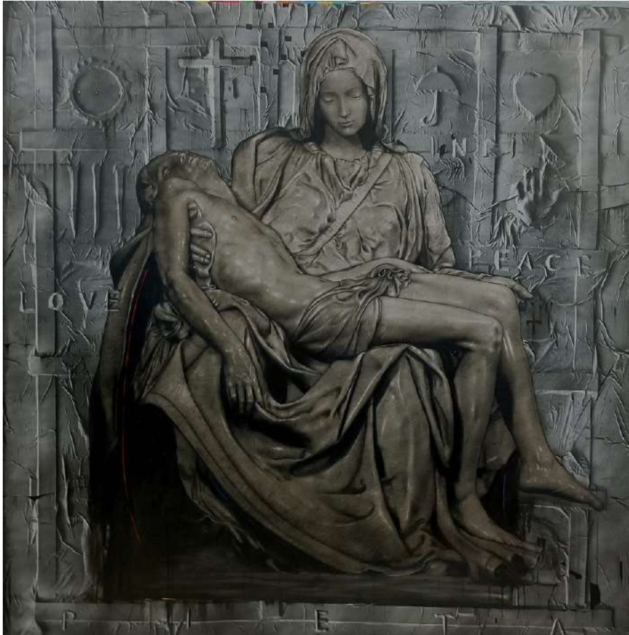
ANGGAR PRASETYO, Pieta 190 x 190 cm, Mix Media on Canvas, 2024