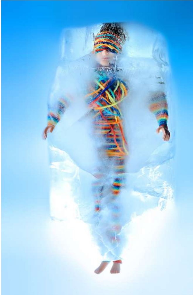
M.A ROZIQ, Lost Identity ed. 1/3 80 x 120 cm, UV Print on Alluminium Composite Panel, 2024