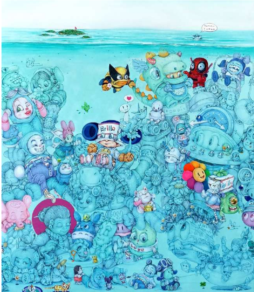
DHANOE , Tanah Harapan 140 x 160 cm, Acrylic on Canvas, 2024