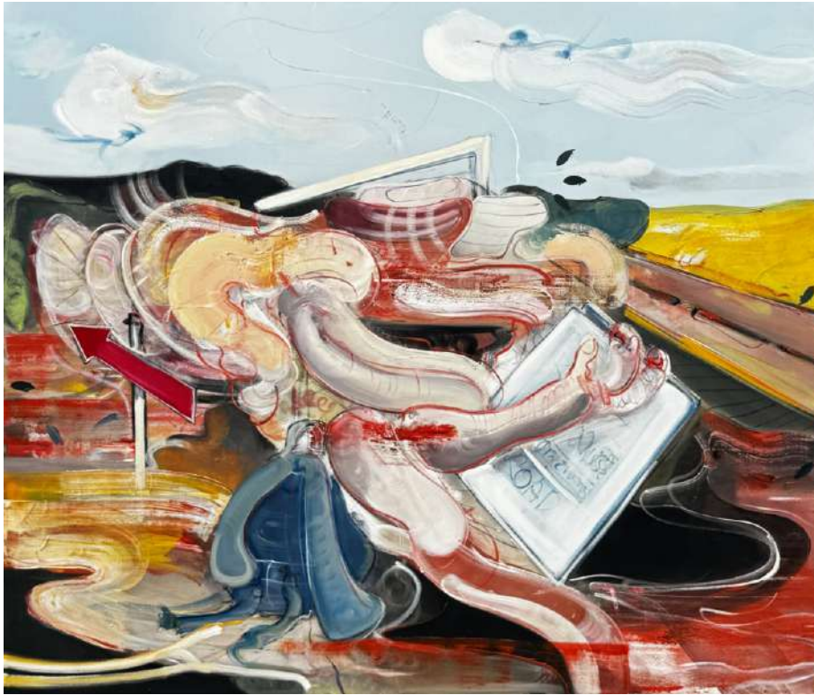
HERRU YOGA, GOODBYE TO MY PICNIC 180 x 154 cm, Oil on Canvas, 2024