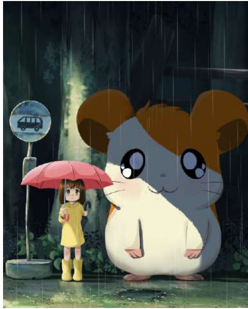
DAVID RIVALDO , My Neighbor Hamtaro (After Hayao Miyazaki) 120 x 100 cm , Oil & Acrylic on Canvas, 2024