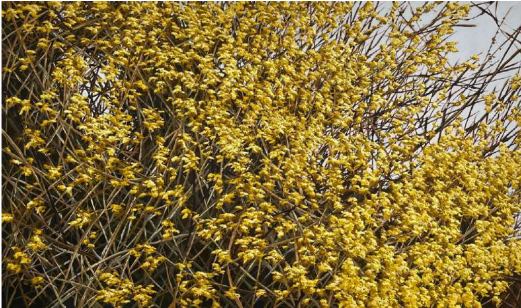
GABRIEL EVA , The Forsythia 120 x 200 cm, Acrylic on Canvas, 2024