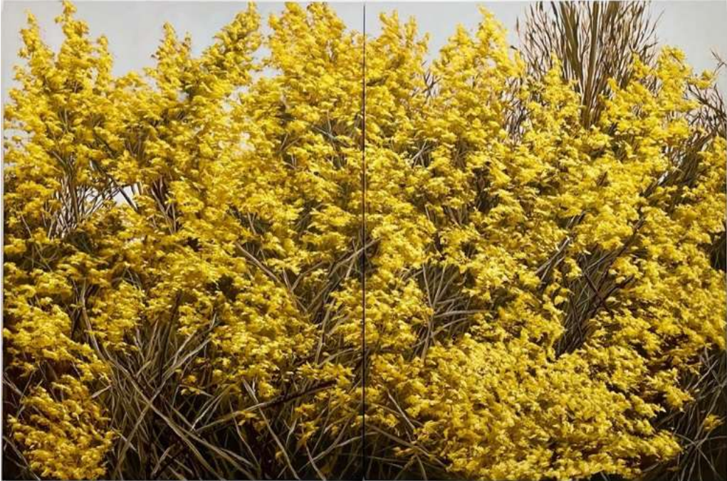
GABRIEL EVA , The Forysthia 200 x 300 cm (diptych), Acrylic on Canvas, 2024