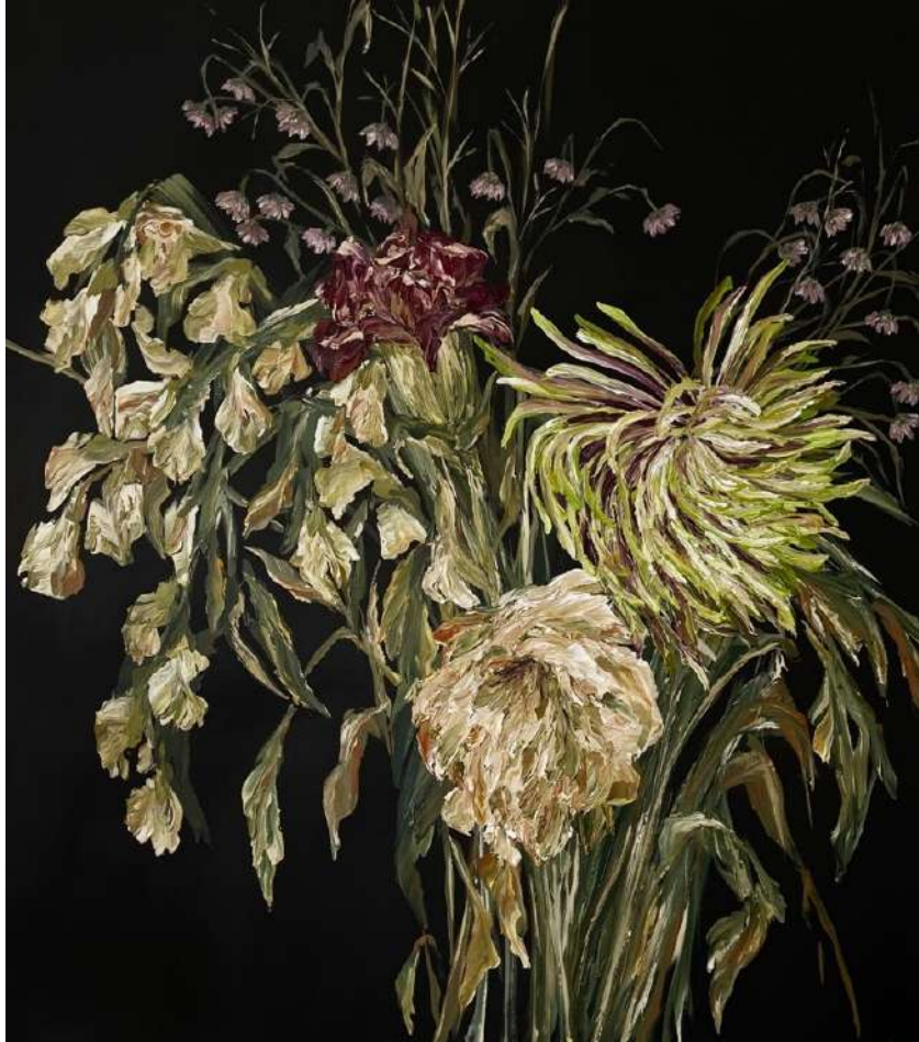
GABRIEL EVA , The Afterlife 170 x 150 cm, Acrylic on Canvas, 2024