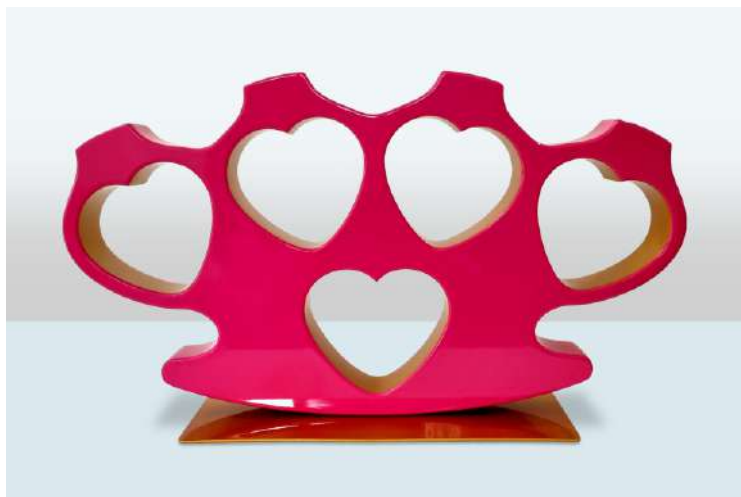
Abell Octovan, Fist of Love 80 x 44 x 25 cm, Mix Media ( Kayu & Besi ), 2024