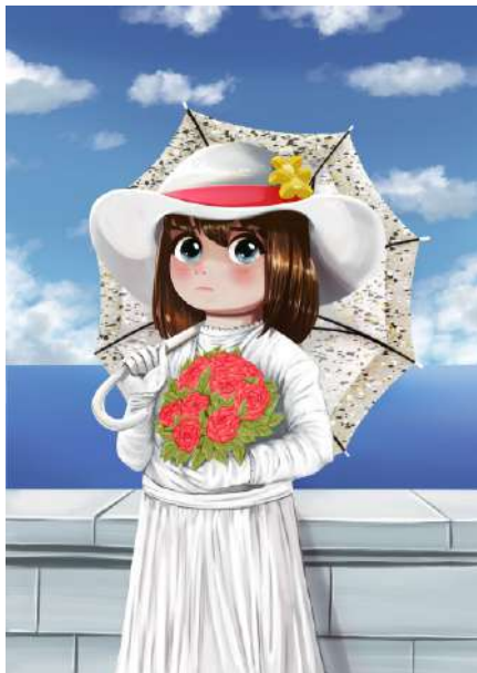
DAVID RIVALDO , The Son of Man (After René Magritte) 100 x 80 cm, Oil & Acrylic on Canvas, 2024