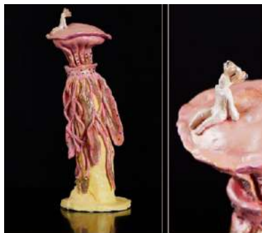
GABRIEL CHEAH, Harmony 34 x 13 x 12 cm, Hand-molded ceramic, European crystals, 2024