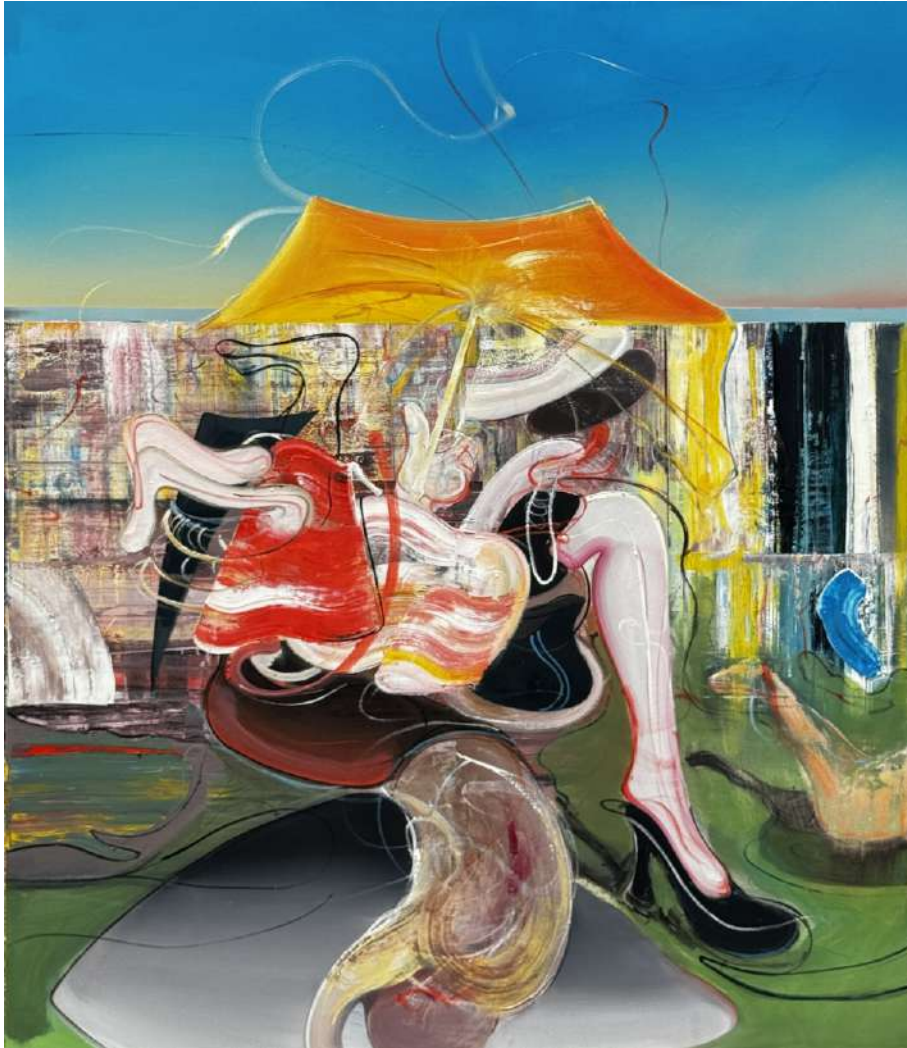
HERRU YOGA, SURPRISE AS A PHYSICAL FORCE 154 x 179,5 cm, Oil on Canvas, 2024