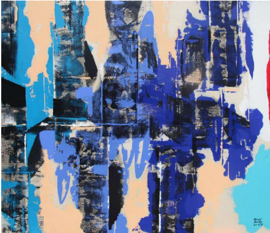
DIPO ANDY , Di Bawah Khaki Langit 170 x 200 cm, Acrylic on Canvas, 2024