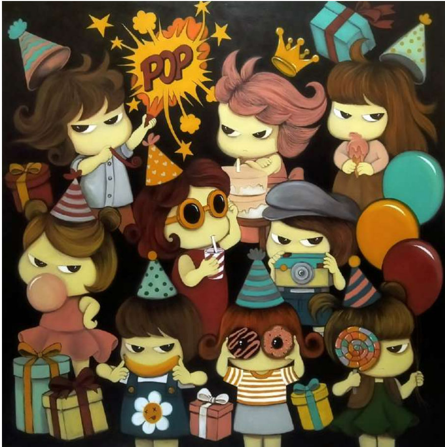
TENNESSEE CAROLINE , Wish You All The Best 150 x 150 cm, Acrylic on Canvas, 2024