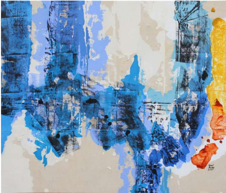
DIPO ANDY , Hari Ini 170 x 200 cm, Acrylic on Canvas, 2024