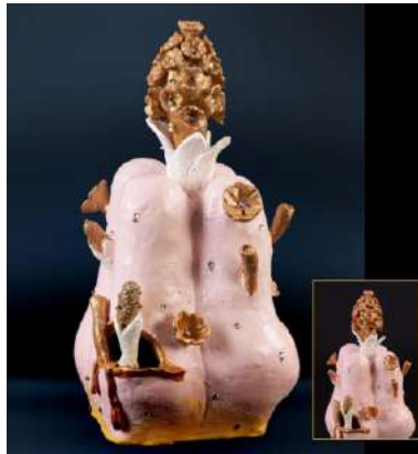
GABRIEL CHEAH, Crystals in My Veins IV 31 x 15 x 17 cm, Acrylic, Hand-molded ceramic, European crystals, 2023