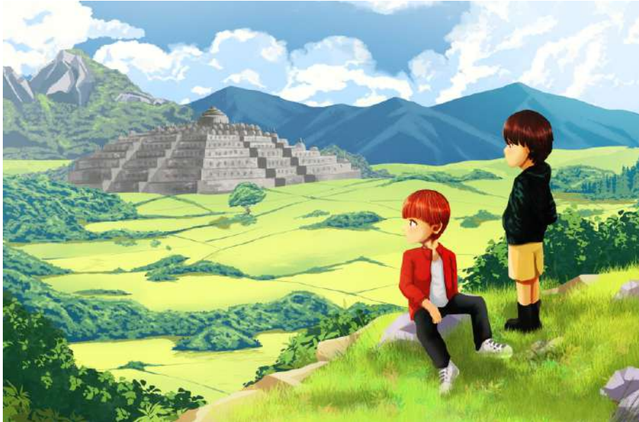
DAVID RIVALDO , Pilgrimage To The Ancestors (After A.A.J. Payen) 150 x 200 cm, Oil & Acrylic on Canvas, 2024