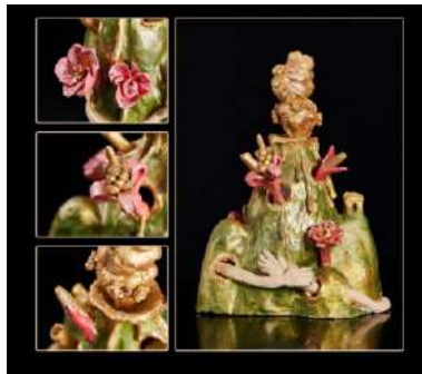
GABRIEL CHEAH, Love 23 x 31 x 21 cm, Acrylic, Hand-molded ceramic, European crystals, 2024