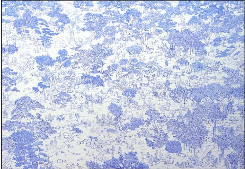
M. IRFAN , Bumi, Alam dan Manusia 165 x 235 cm, Acrylic on Canvas, 2024