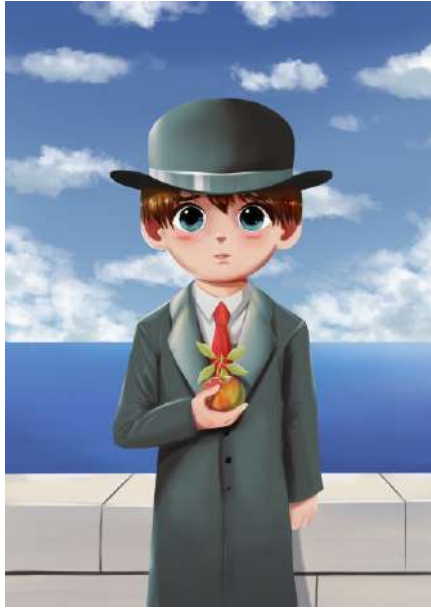
DAVID RIVALDO , The Son of Man (After René Magritte) 100 x 80 cm, Oil & Acrylic on Canvas, 2024