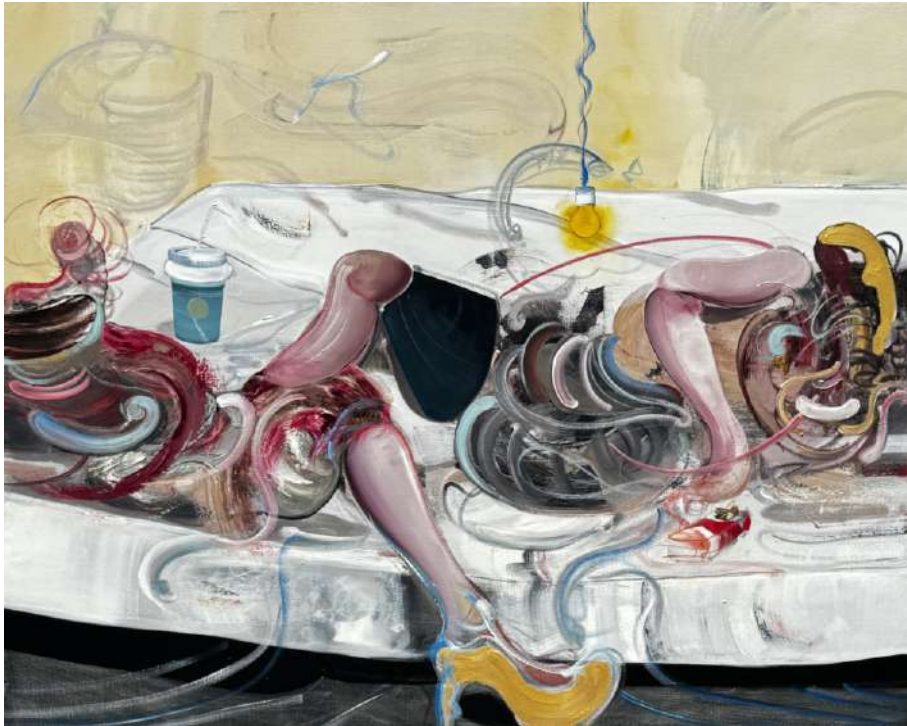
HERRU YOGA, ODALISQUE SCENE #1 196 x 156 cm, Oil on Canvas, 2024