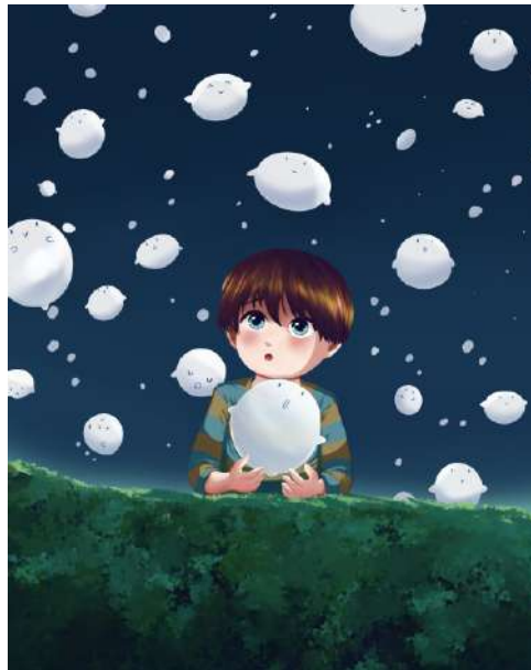
DAVID RIVALDO , The Boy and The Heron (After Hayao Miyazaki) 120 x 100 cm , Oil & Acrylic on Canvas, 2024