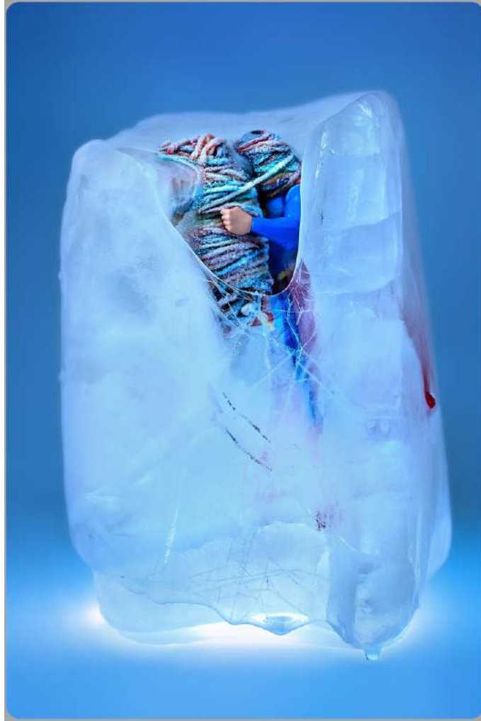
M.A ROZIQ , Identity Syndrome ed. 1/3 80 x 120 cm, UV Print on Alluminium Composite Panel, 2024