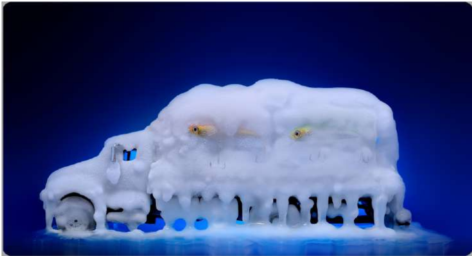
M.A ROZIQ , Waiting List #2 ed. 1/3 165 x 120 cm, UV Print on Alluminium Composite Panel, 2024