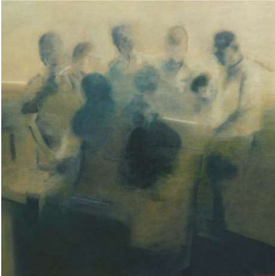
NGAKAN ARDANA , Only Chrome Survive 200 x 200 cm , Oil on Canvas, 2019