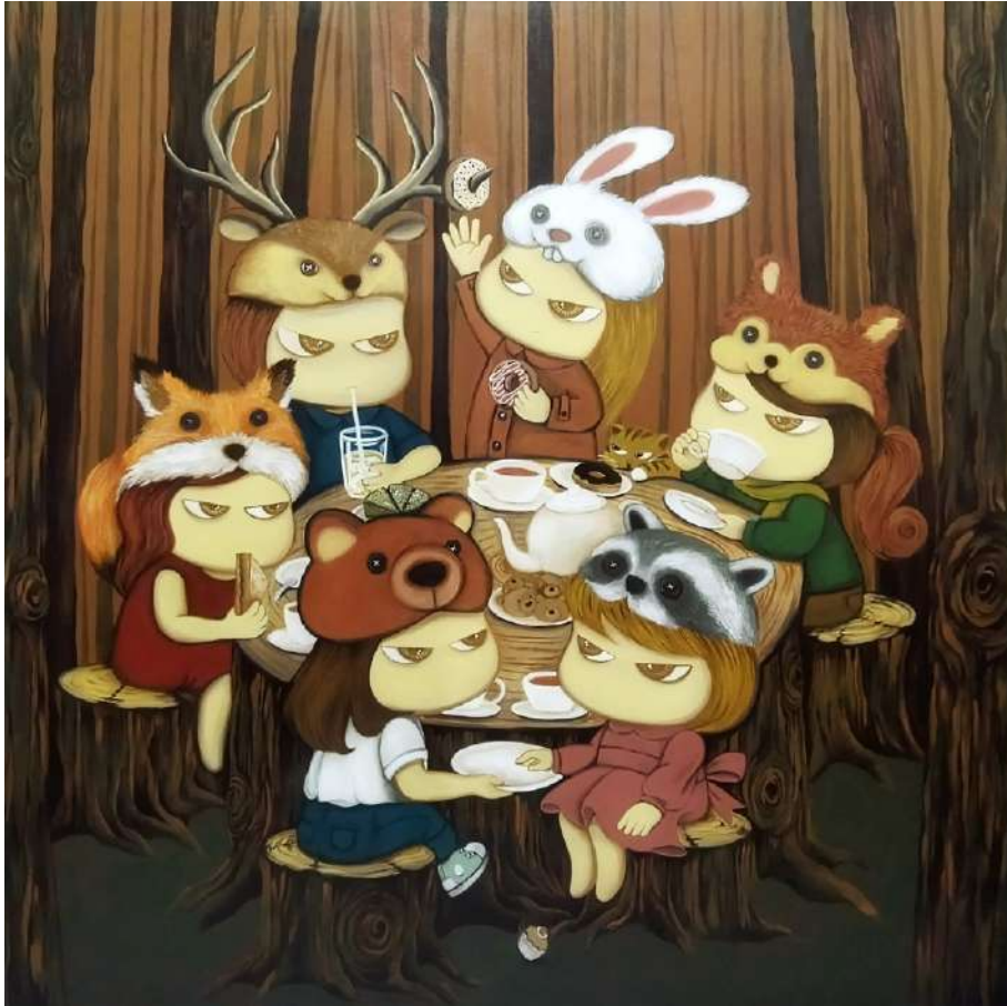
TENNESSEE CAROLINE , Picnic 150 x 150 cm, Acrylic on Canvas, 2024