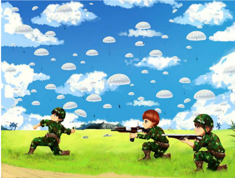
DAVID RIVALDO , Paratroopers Descending on Borobudur (After Tsuruta Goro) 150 x 200 cm, Oil & Acrylic on Canvas, 2024