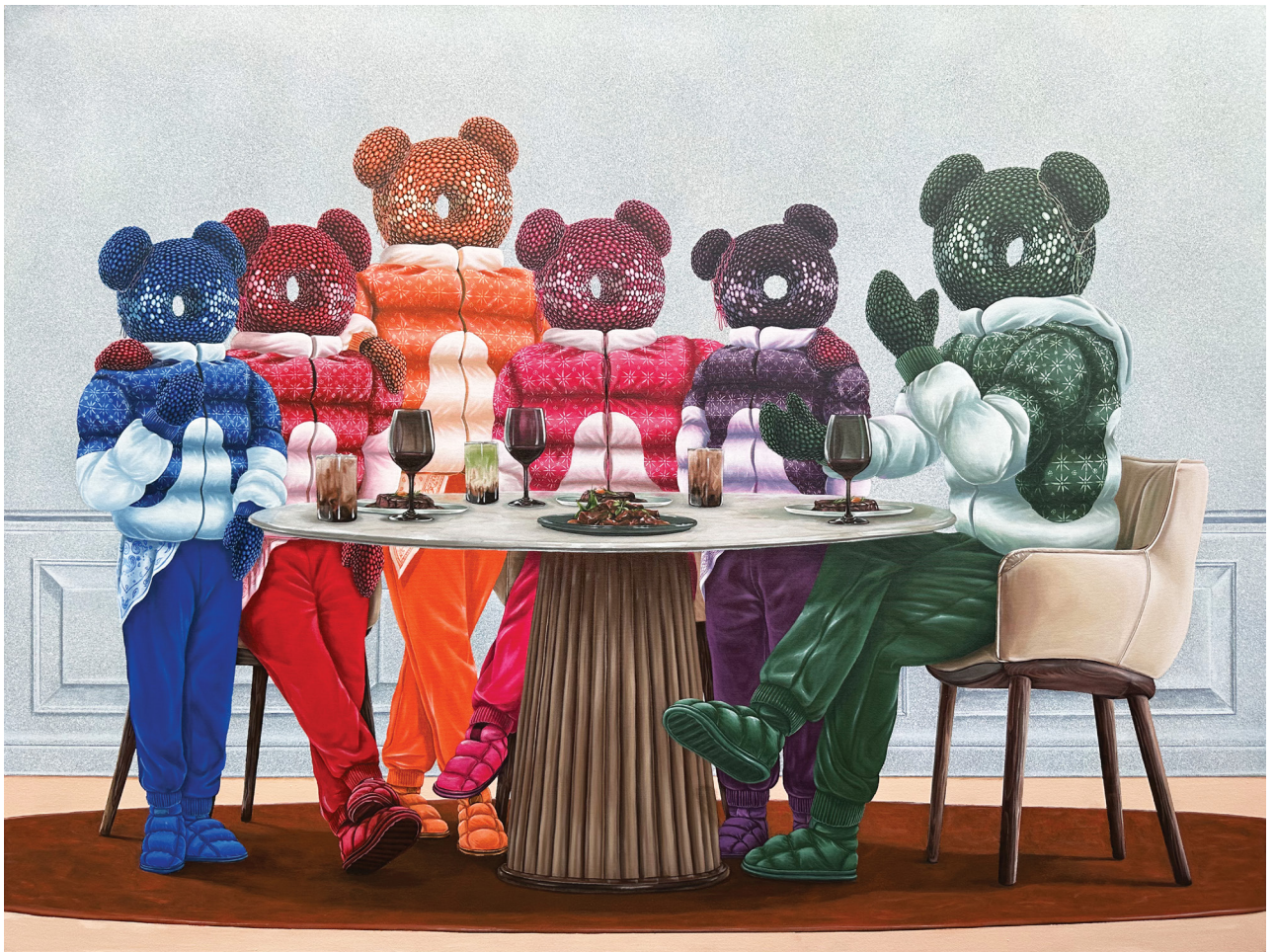
Apin "Ritual Kasih di Meja Makan" Acrylic on Canvas 150 x 200 cm 2024