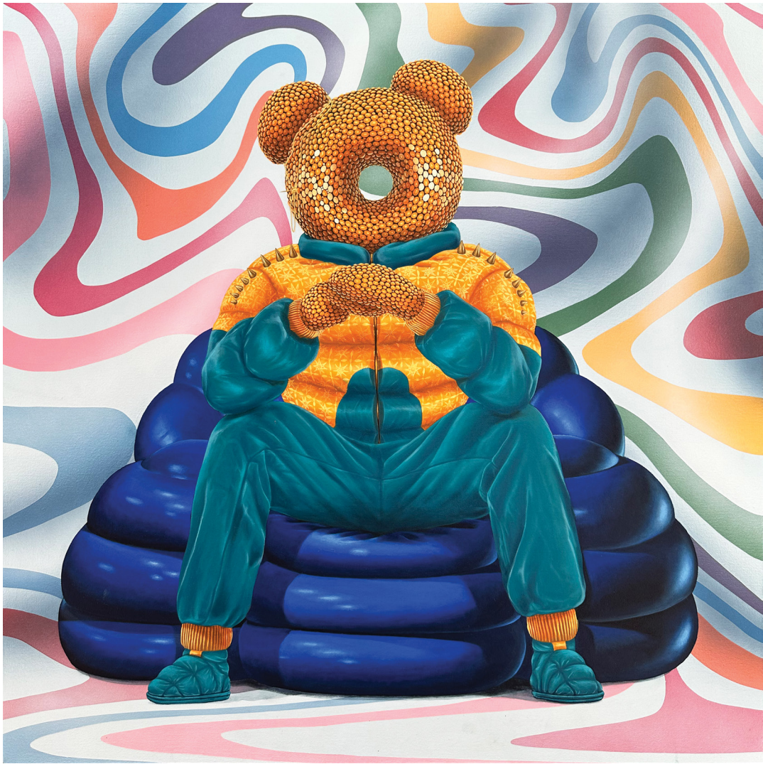
Apin "Gema Pikiran: The Orion Series" Acrylic on Canvas 120 x 120 cm 2024