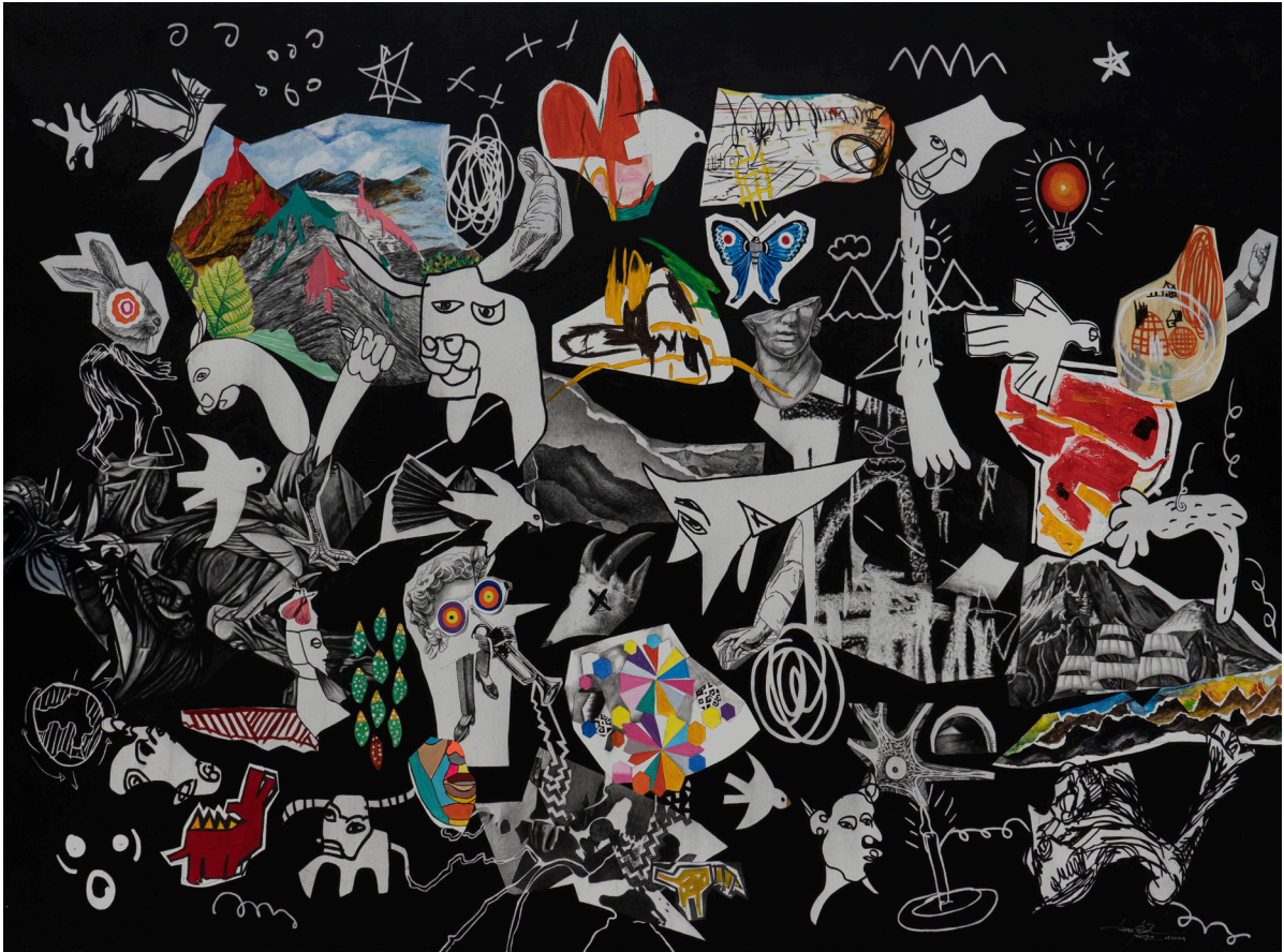
Bestrial Besta Untuk Sementara Charcoal, Acrylic on Linen 150 x 200 cm 2024