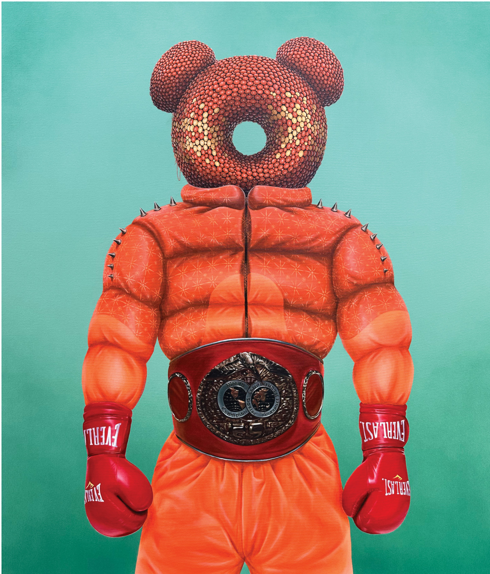
Apin "The Belt That Speak" Acrylic on Canvas 140 x 120 cm 2024