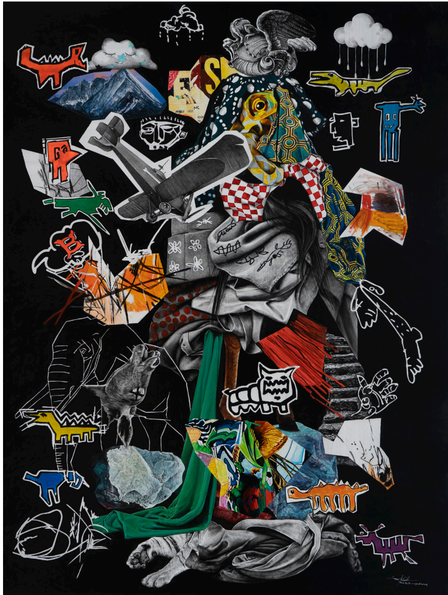
Bestrizal Besta Atas Tengah Bawah Charcoal, Acrylic on Linen 200 x 150 cm 2024