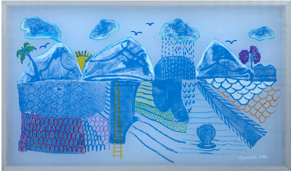
Theresia Agustina Sitompul Domestic Landscape #02 Afdruk emulsion and Oil pastel on Silk Screen T90 90 x 150 cm 2024