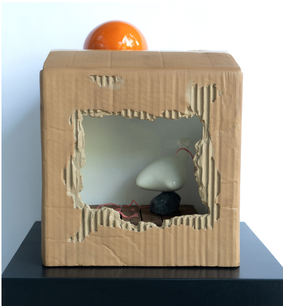
Ridho Scoot Transisi (Seri Tumbuh No. 8) Resin, wood, angle iron, acrylic sheet, polyurethane paint 32 x 25 x 25 cm 2024