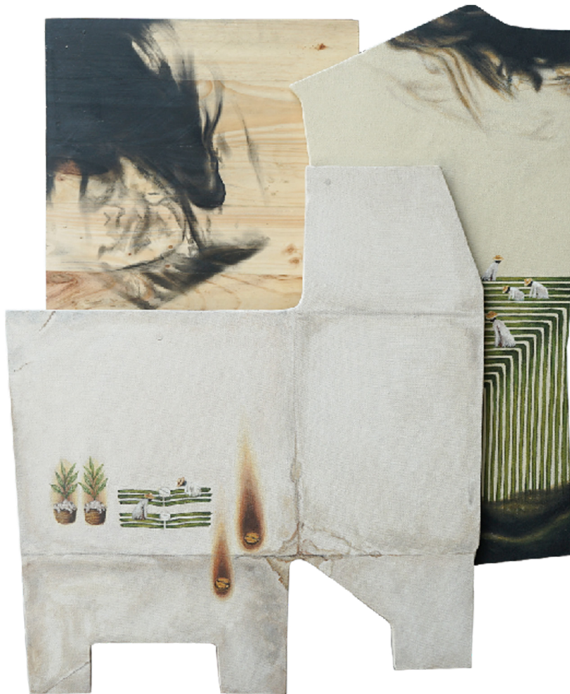
Maharani Mancanagara Apostles of Enlightenment #2 Acrylic on Canvas, Charcoal on Wood 100 x 80 x 8 cm 2024