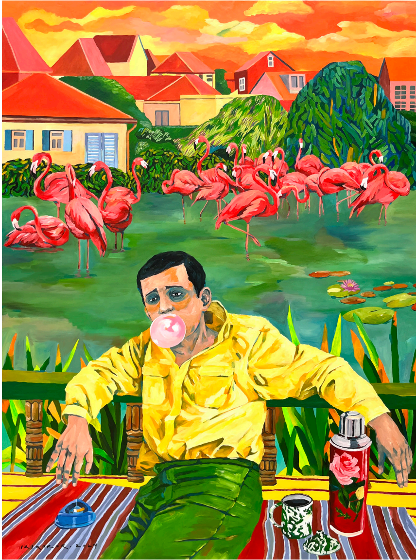
Iqi Qoror Afternoon Shoot Acrylic on Canvas 200 x 150 cm 2024