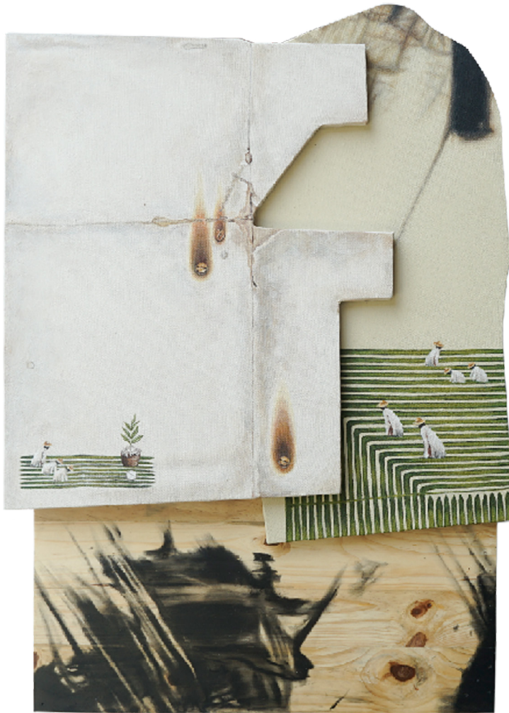
Maharani Mancanagara Apostles of Enlightenment #3 Acrylic on Canvas, Charcoal on Wood 100 x 70 x 8 cm 2024