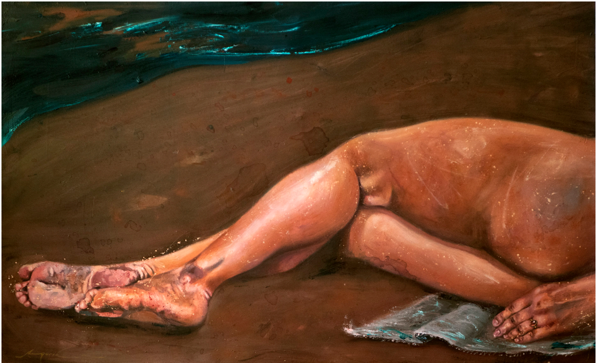
Ayurika Mirah Dalima Oil on Canvas 75.5 x 125 cm 2024