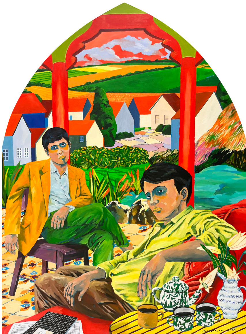
Iqi Qoror Night Watch Rendezvous Acrylic on Canvas (Arch Shaped Canvas) 200 x 150 cm 2024