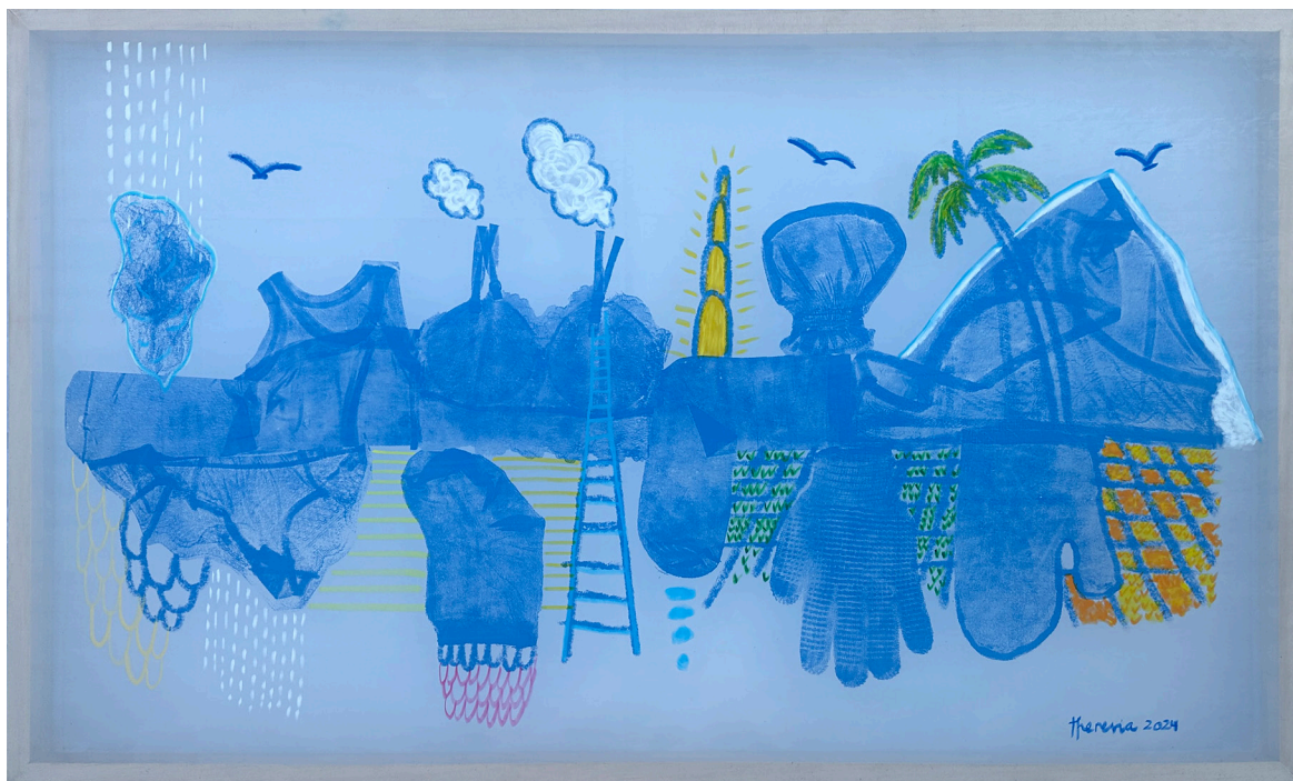
Theresia Agustina Sitompul Domestic Landscape #01 Afdruk emulsion and Oil pastel on Silk Screen T90 90 x 150 cm 2024