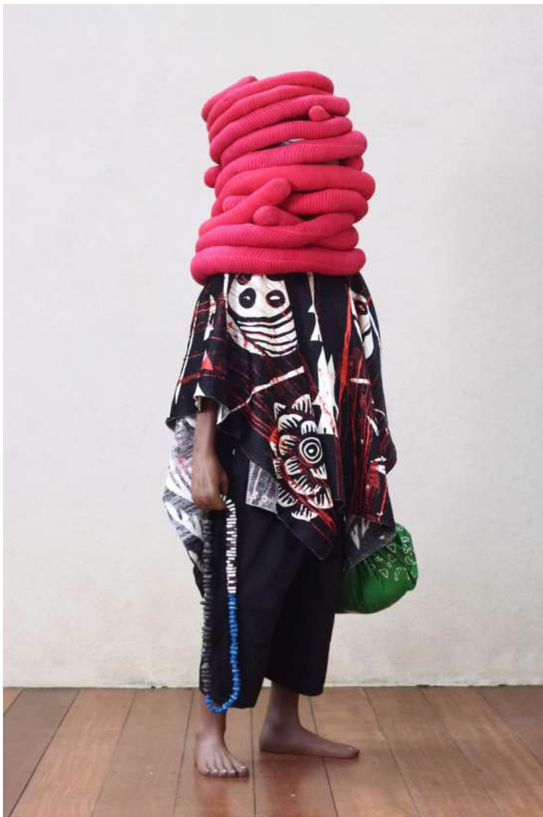
The Dance Corps series "The World In Phobia"