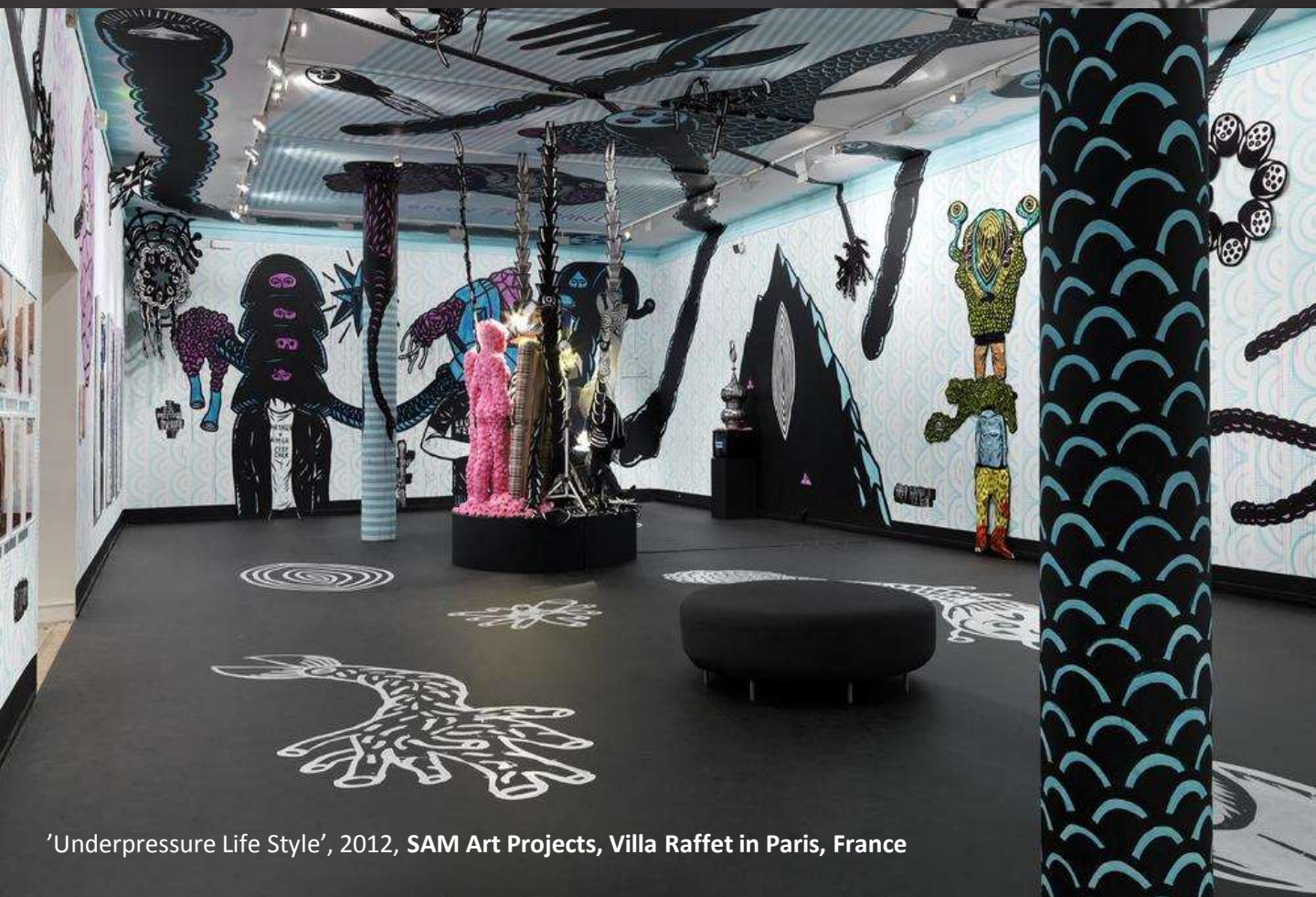
'Underpressure Life Style', 2012, SAM Art Projects, Villa Raffet in Paris, France