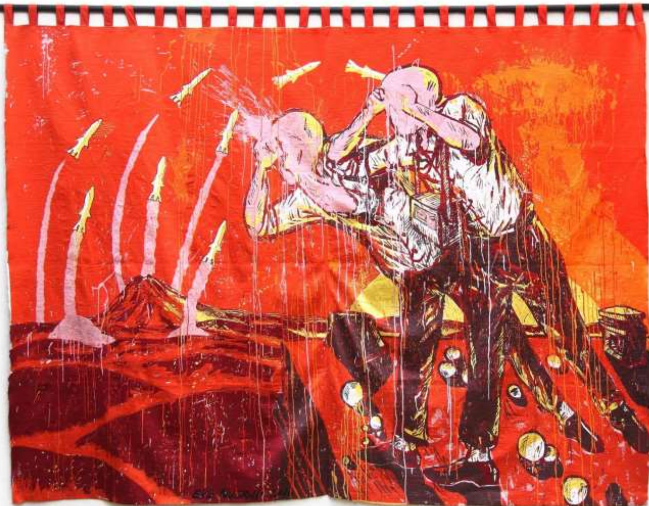
We Are Happy With Wrong Focus