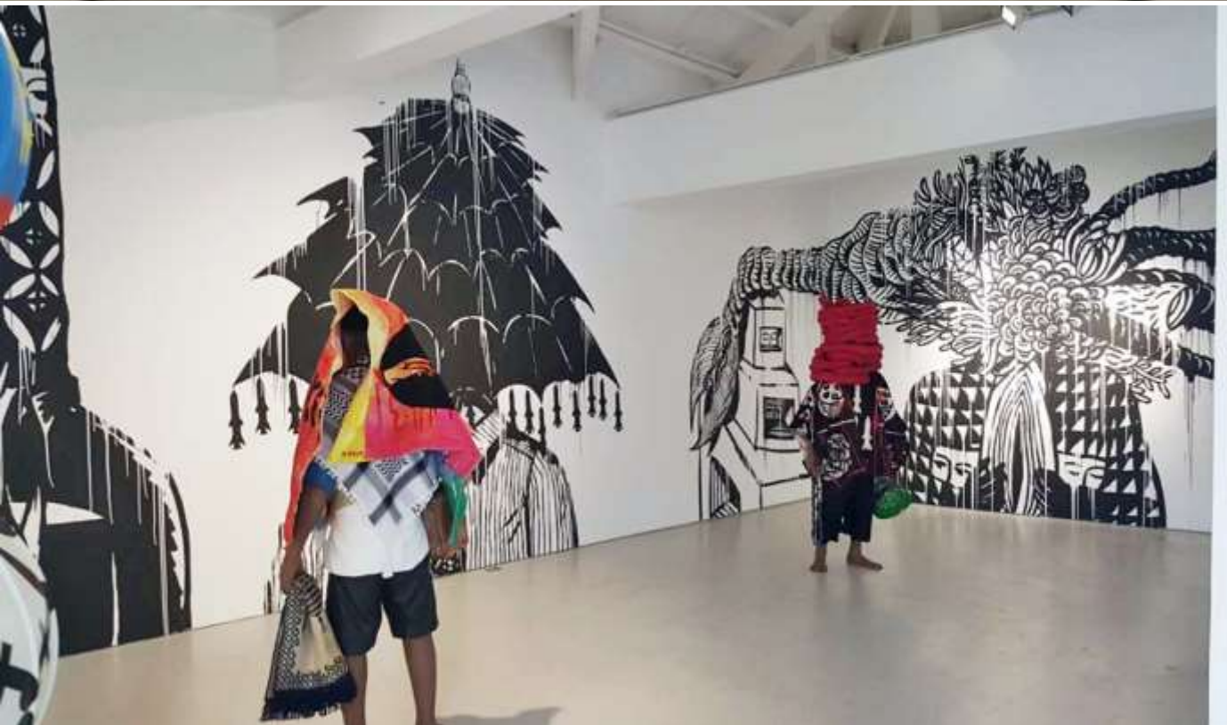
'UH-OH UH-OH UH-OH (the world complaining)', ARARIO GALLERY Shanghai, China, 2016