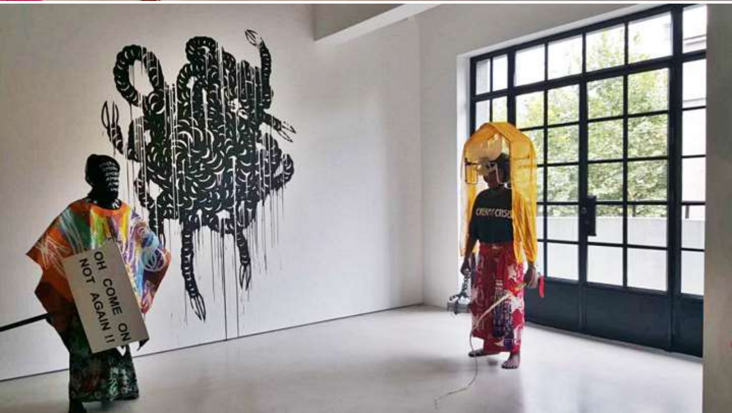
'UH-OH UH-OH UH-OH (the world complaining)', ARARIO GALLERY Shanghai, China, 2016