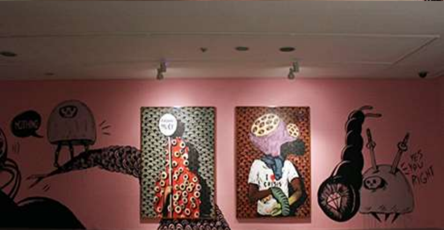
'Beacons of Archipelago', 2010, Arario Gallery, Cheonan, Korea