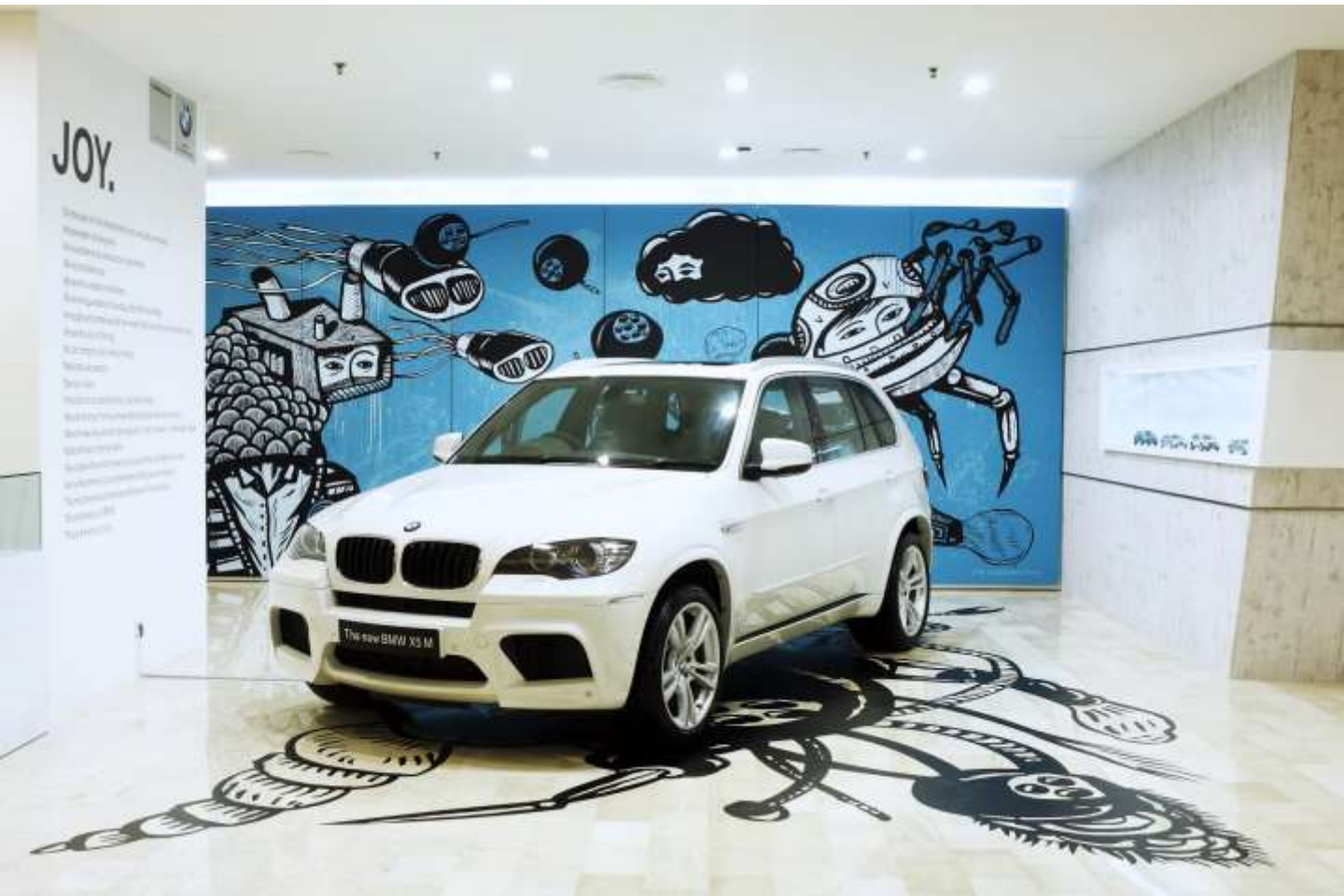
Collaboration with BMW, 2010 'BMW X5 M with Eko Nugroho's art'