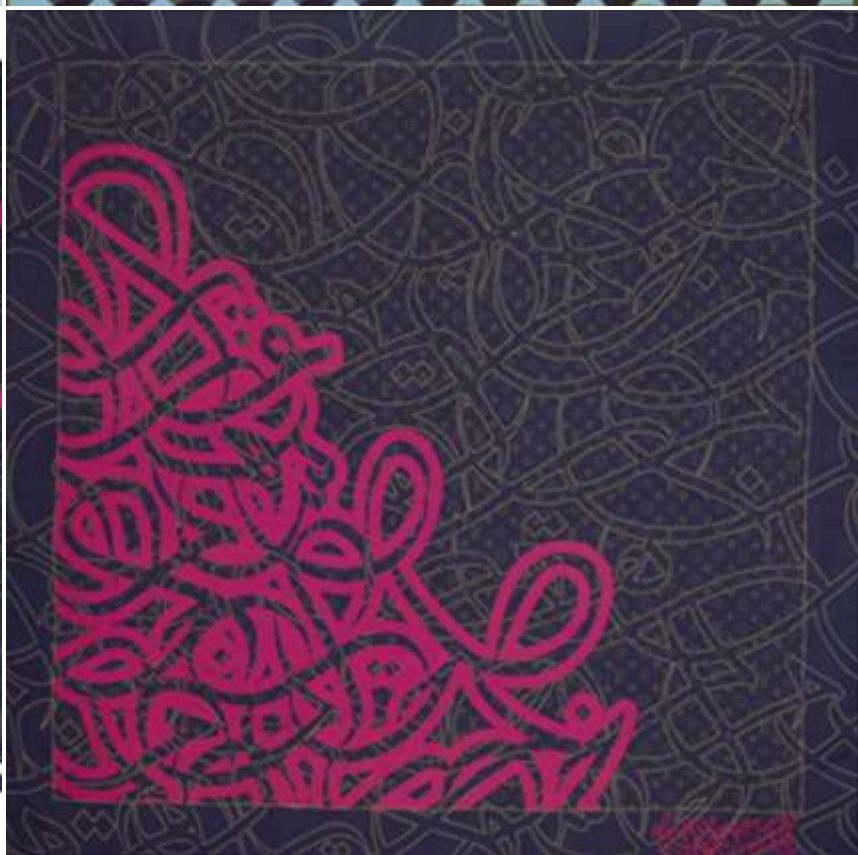
Collaboration with Louis Vuitton, 2013

'Louis Vuitton limited edition scarf series, 2013 Fall / Winter collection'