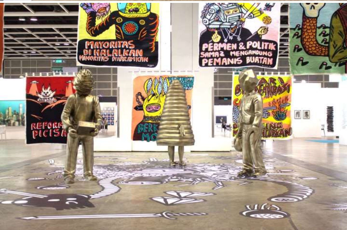
Installation view at Encounters Project, Art Basel Hong Kong, 2014