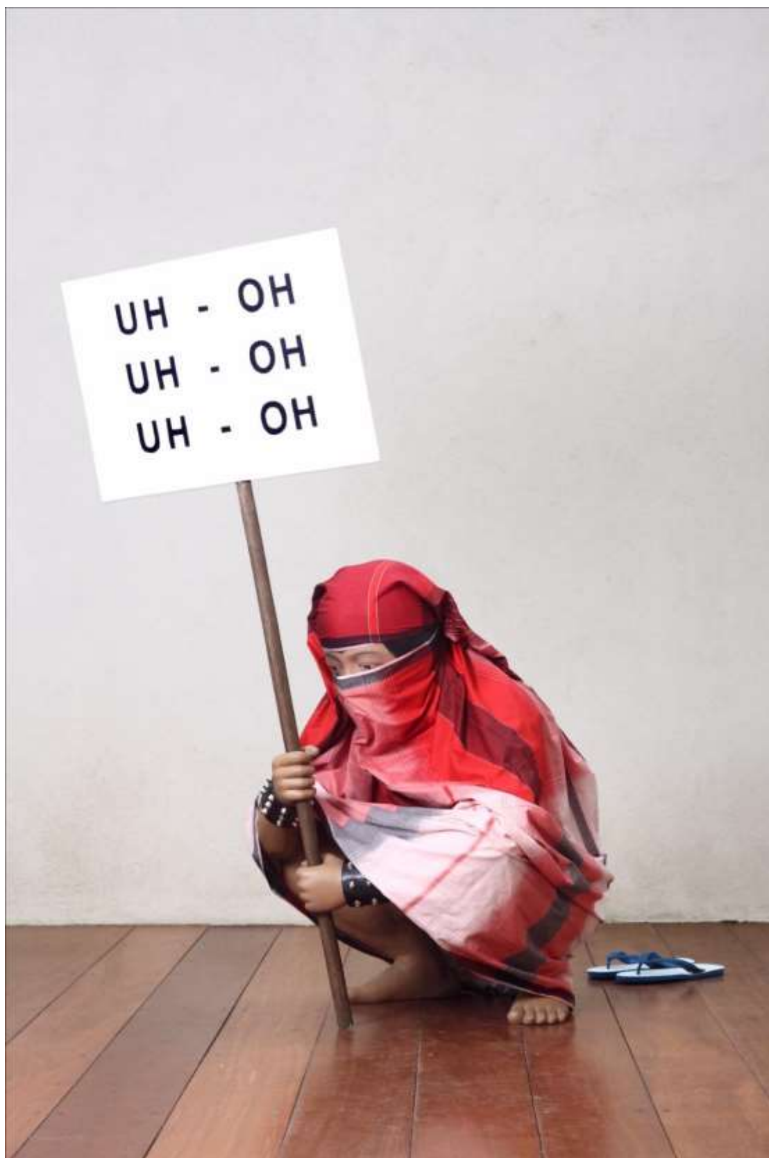
The Dance Corps series "Protester With New Issue"