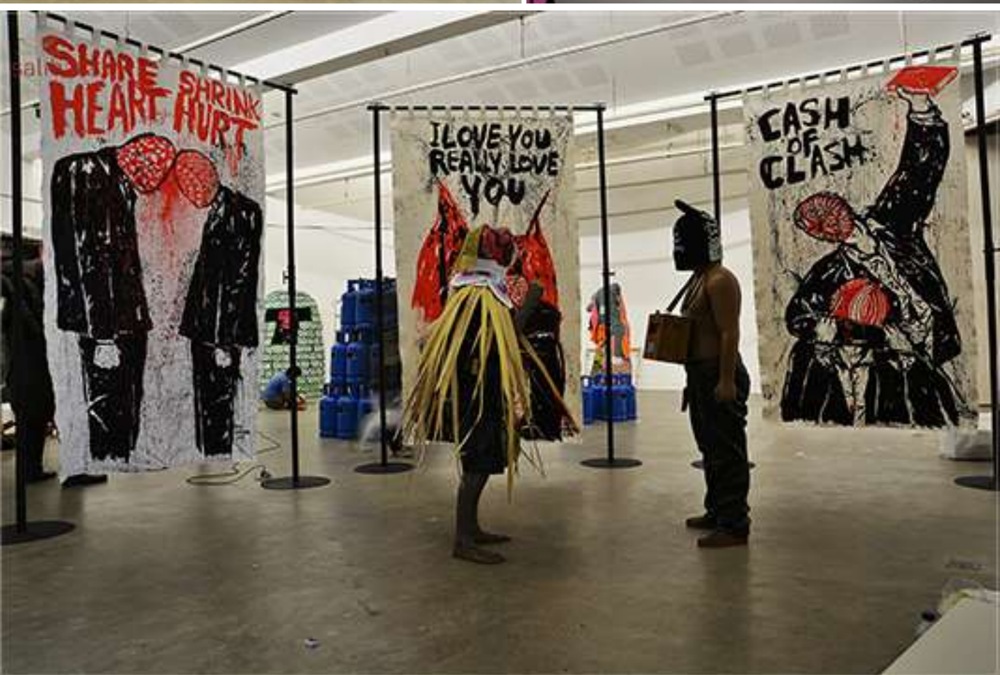
Installation view at Solo Exhibition "LANDSCAPE ANOMALY", Salihara, Jakarta, Indonesia, 2015