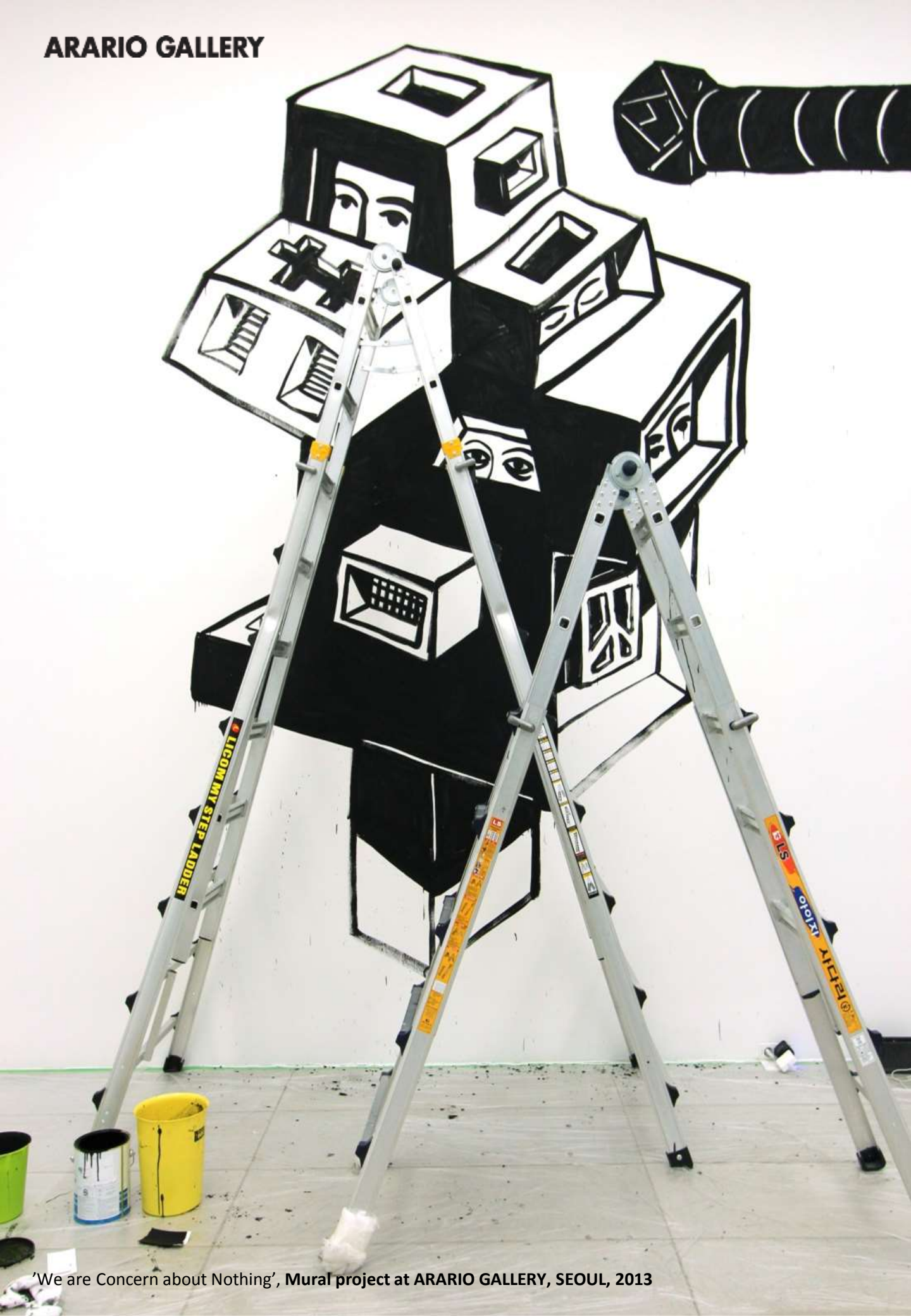
'We are Concern about Nothing', Mural project at ARARIO GALLERY, SEOUL, 2013