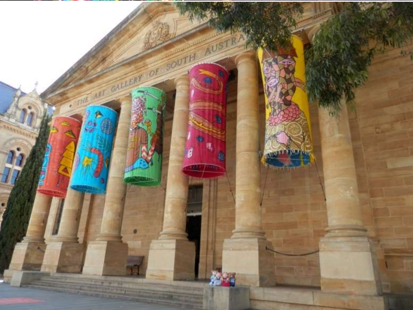
Installation view at OZ Asia Festival, Art Gallery of South Asia, Adelaide, Australia, 2015