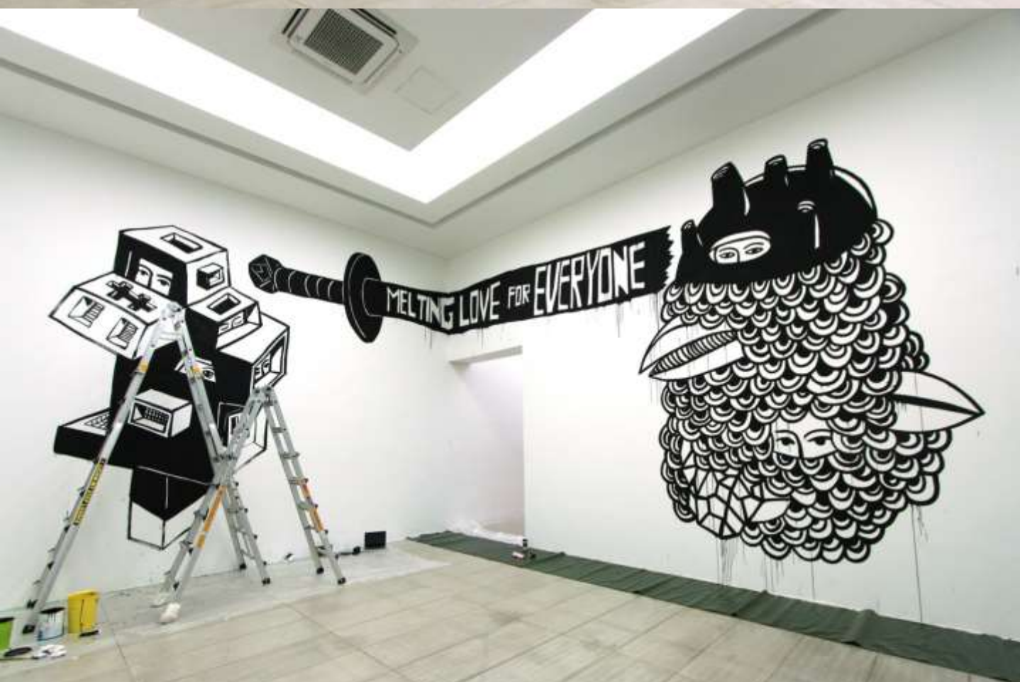
'We are Concern about Nothing', Mural project at ARARIO GALLERY, SEOUL, 2013