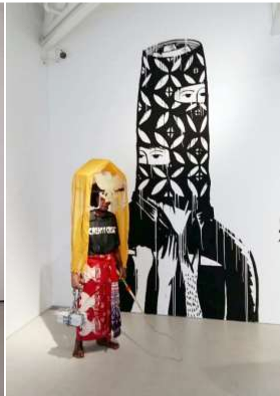
'UH-OH UH-OH UH-OH (the world complaining)', ARARIO GALLERY Shanghai, China, 2016