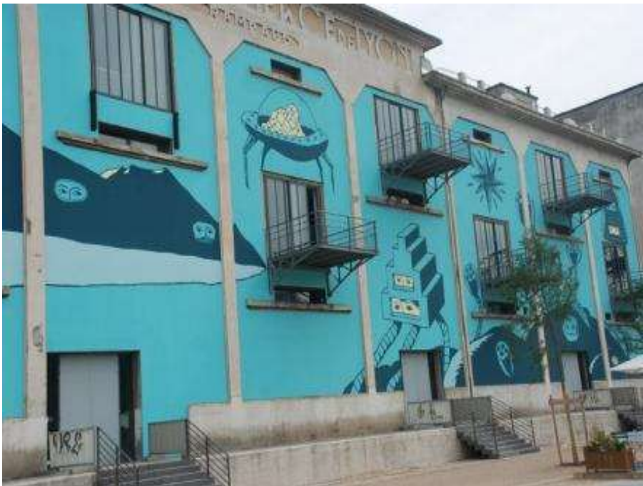
'Cut The Mountain & Let It Fly, 2009 Group exhibition 'Contemporaneity', MOCA Shanghai, China