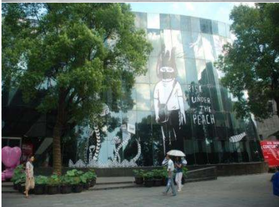
'Rise Under the Peach', 2010 Group exhibition 'Contemporaneity', MOCA Shanghai, China