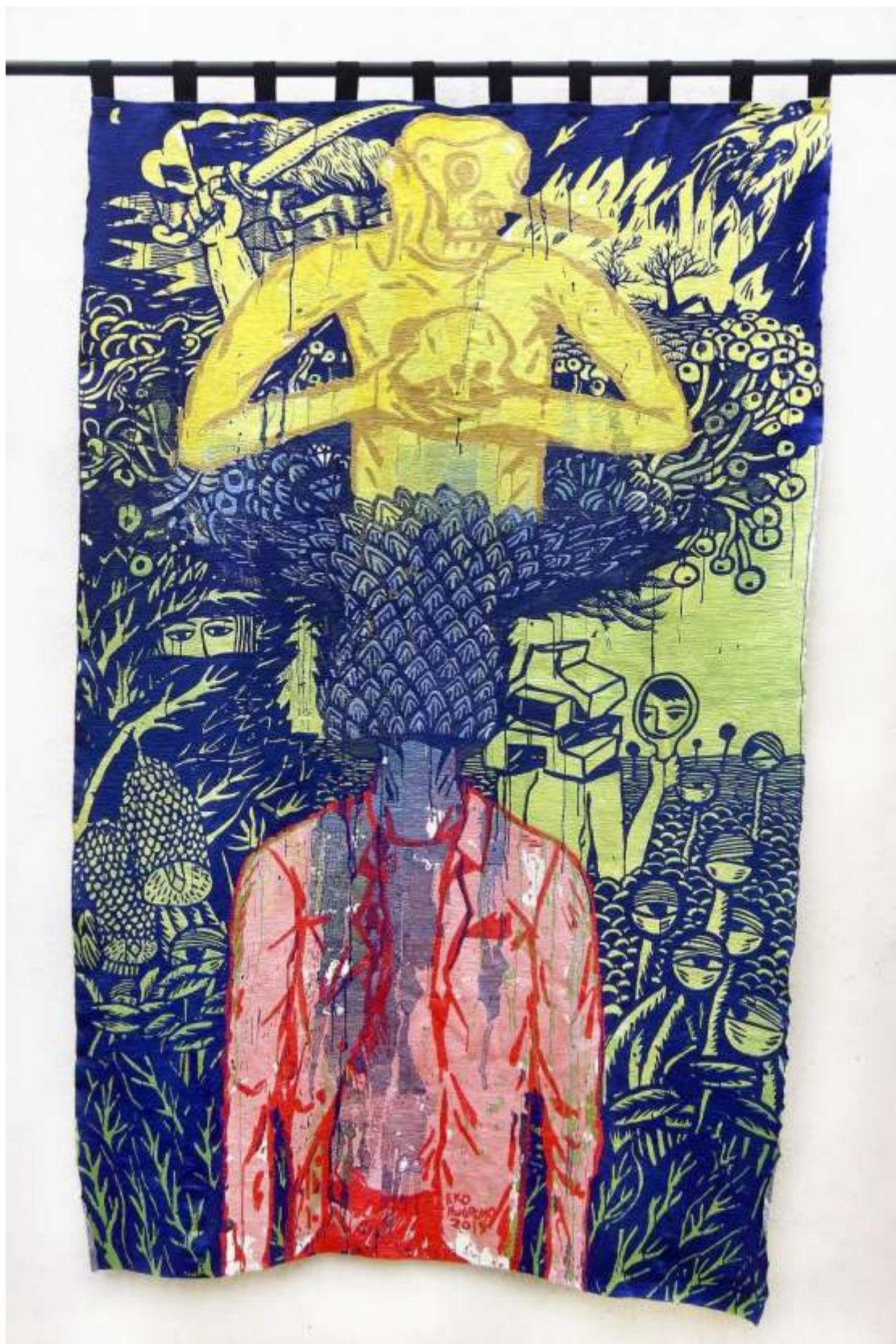
The Puppet Without Shadow