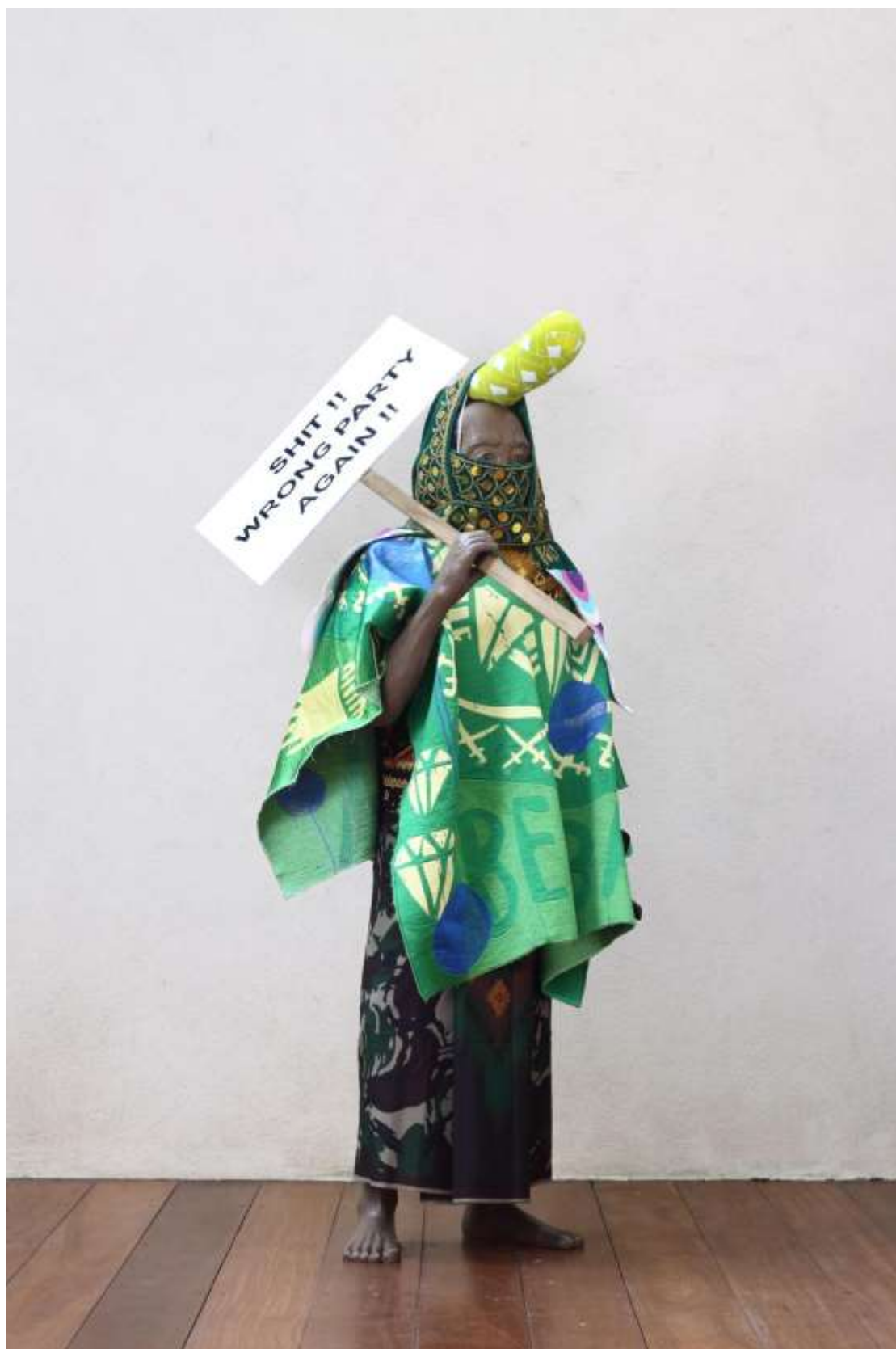
The Dance Corps series "Warrior Without Any Target"