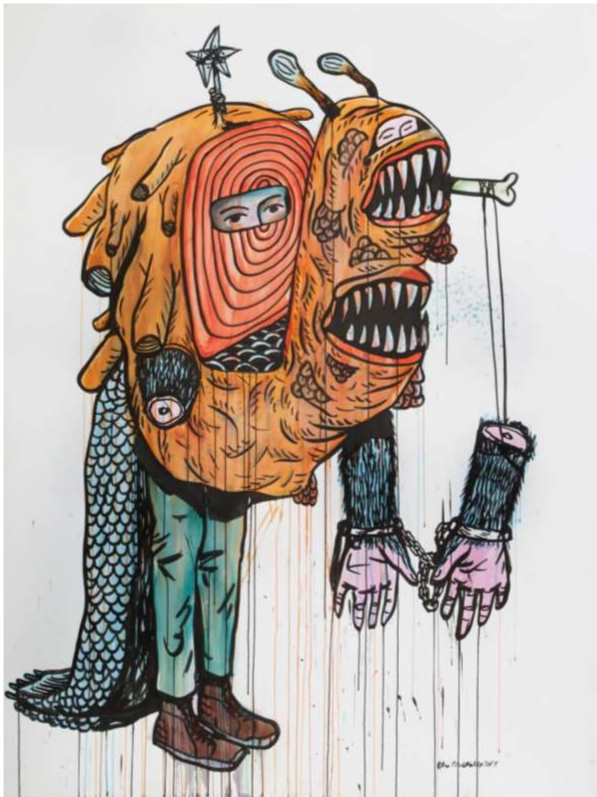
Lets Talk About Revolution to My Hand