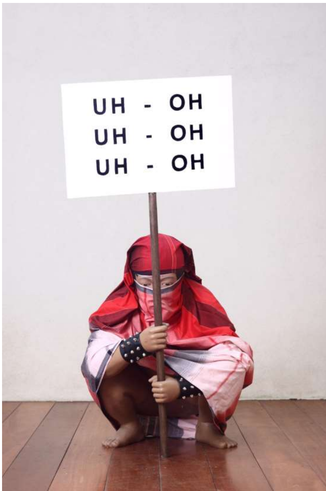
The Dance Corps series "Protester With New Issue"